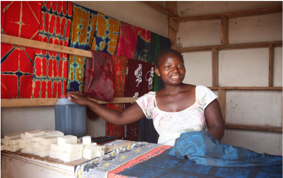
Msanzi women's group shop